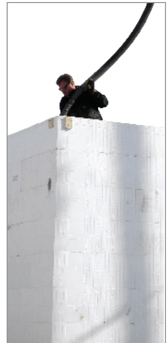
The Fox Blocks extended 90° corner block showing it's stand alone strength during concrete placement.

COST: The Fox Blocks corners cost the same per square foot as the Fox straight block. Cost will appear higher than our competitors because our corners are 16" or more in length. In many cases our corners are actually lower in cost per square foot and at the same time saving you even more in time and materials.