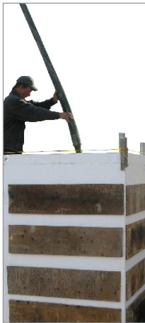
Some competitive ICF's strap corners with lumber for strength during concrete placement.

PROBLEM: Historically, Corner Blocks have proved to be very difficult for installing contractors to hold the corner positioning or actually holding concrete during the consolidation process. Contractors have resorted to inserting internal ties, external strapping and bracing to gain needed strength. This adds cost in additional materials and man-hour rates.