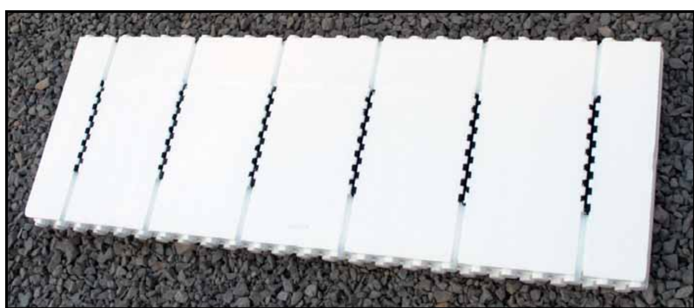
Each panel is 16" x 48"