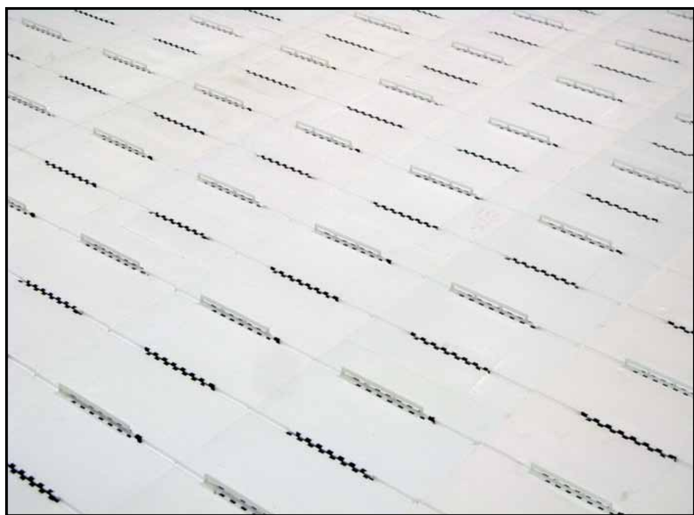
A section of wall with Tilt Inserts @ 16" o/c