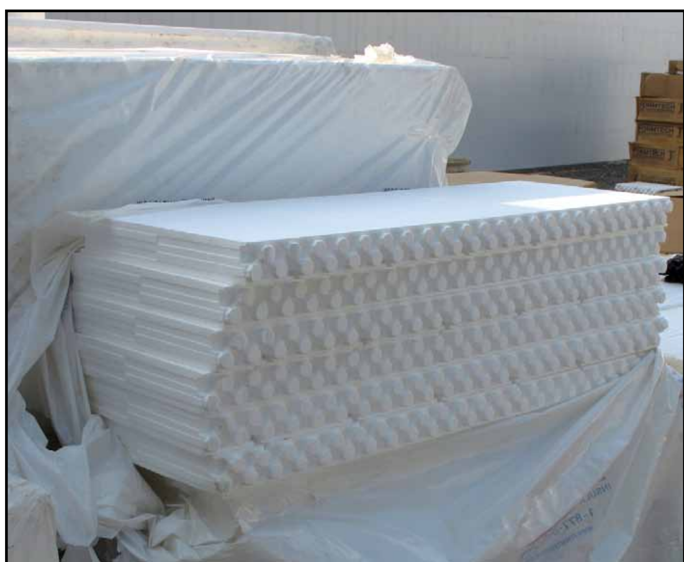
Bags of Fox Blocks - 1440 panels There are 10 panels in each bag. Enough to do 53 sq. ft. of wall.

Sample cross section showing a 16' tilt up wall with 7" concrete and 2 1/2" 1440 tilt panels 7" + 2 1/2" = 9 1/2" total wall thickness